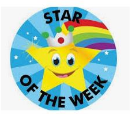
SPRING TERM Week 23, 24 and 25 Stars of the Week

Mars - 1,148 Neptune - 944 Saturn - 1,051 Jupiter - 708