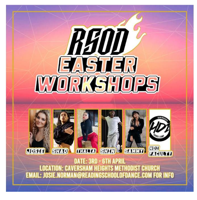
RSOD (Reading School of Dance) 9 - 3pm 6 - 18 Years old (with two different age groups) £25 per day