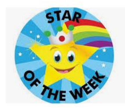
AUTUMN TERM Week 10, 11 and 12 Stars of the Week