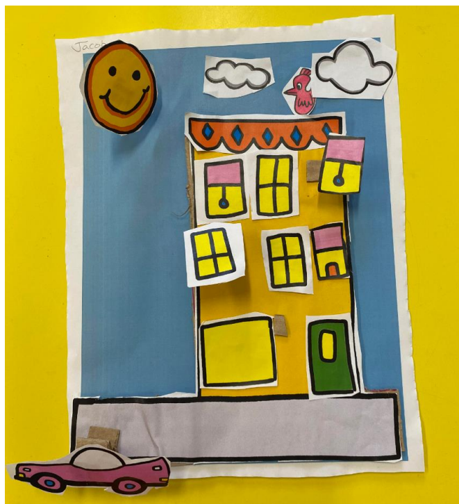
A picture created by Jacob in Year 1

The children have also been really excited to be working in the ICT suite, they have been learning how to log on and off the computer and how to access and use the paintz.app to draw their own pictures.