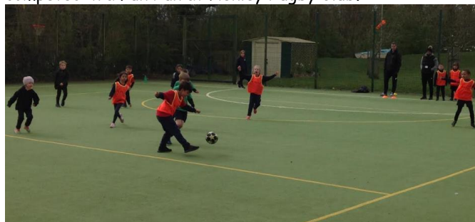
Kidmore End hosted the Year 1 tournament on the AWP

Last week Year 1 and Year 2 competed in football tournaments at Kidmore End and at Peppard Primary. The week before, the Year 5 and Year 6 children competed in Indoor Athletics in Oxford and the Cross Country Runners competed in a Fun Run at Henley Rugby Club.